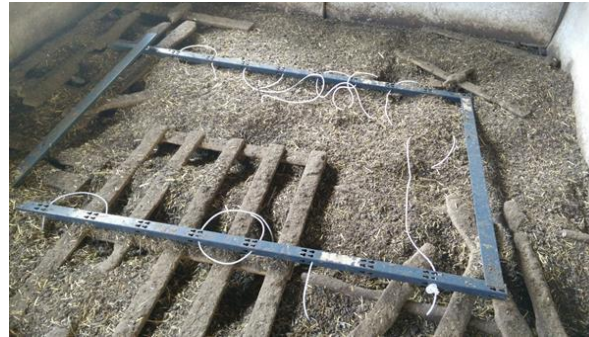
J21' non,treated'polyethylene' rods''