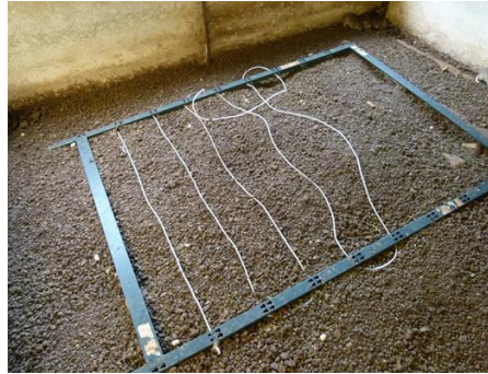
J56' Terrarium'23' non,treated'polyethylene' rods''