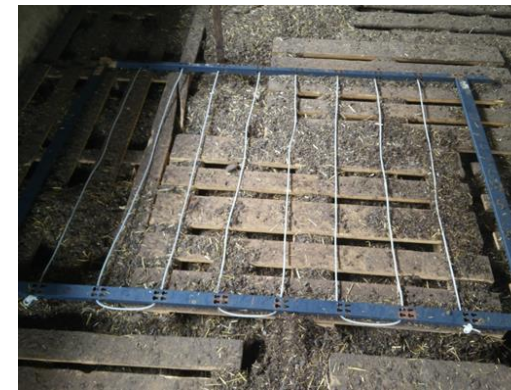
J15' polyethylene'rods'treated'with'master' batch'9028'PE'Anti'rodent'at'2'%%'