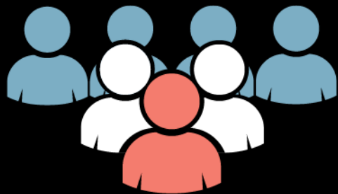
Group of Chief Scientific Advisors