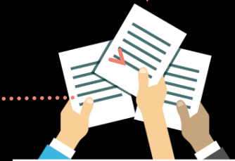
Proposals for Policy or Legislation