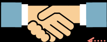
Better Policy making and Legislation Outcome for citizens