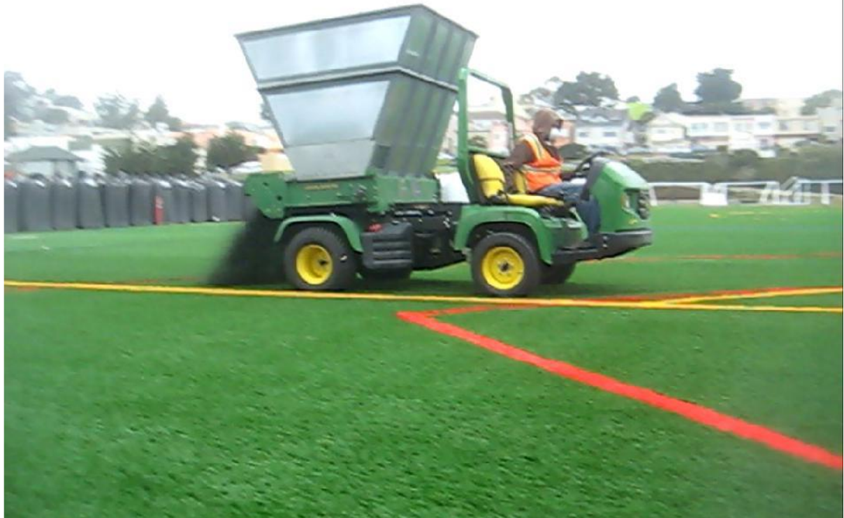
Figure 3.2 Semi-mechanised application of infill

This is normally done by one or two units per field. Big-bags are unloaded directly in the cargo bed of the truck, however if problems arise, workers can break the sacks manually. The infill is then brushed into the carpet using another tractor. Manual raking might occur as well.