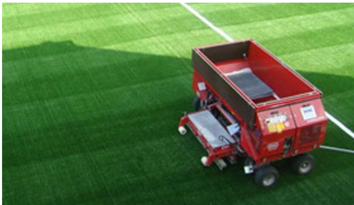
Figure 3.1 Mechanised application of infill

According to the ESTO (2016), the procedures used to install the infill vary depending on the country and contractor. Larger companies will use machines to distribute the infill and brush into the synthetic turf carpet (see Figure 3.1).