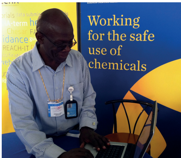
An ICCM-3 meeting participant studies the ECHA website at the Agency's information stand in Nairobi.