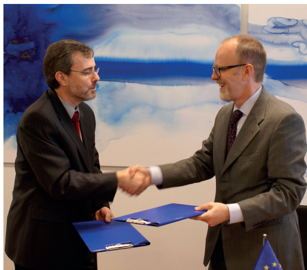
The ECHA-Canada Memorandum of Understanding was signed in 2010.

Whereas the first policy addresses the candidate countries and potential candidates for EU accession, ENP is directed towards engaging 16 countries at the immediate external borders of the Union. ECHA has contributed to both policy areas with regard to the approximation, application and enforcement of EU legislation.